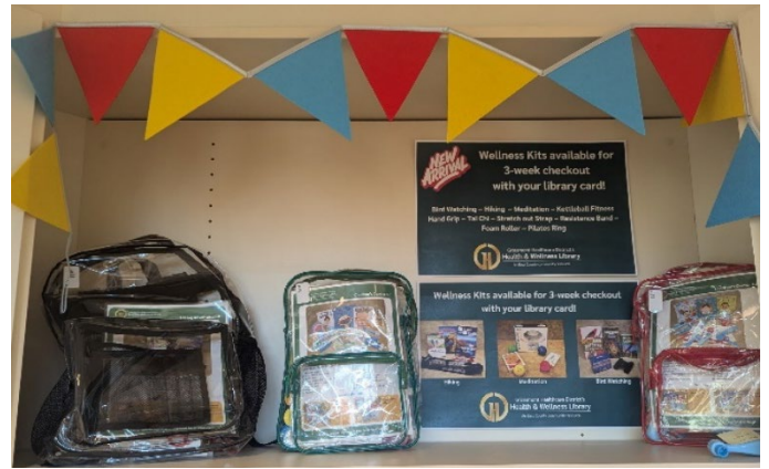
New materials added to the collection!