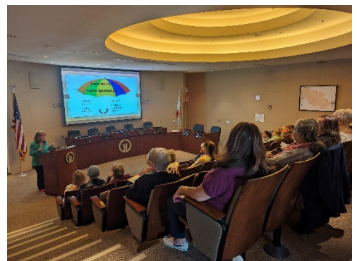
"All About Autism" Wellness Wednesday presentation on April 24 th