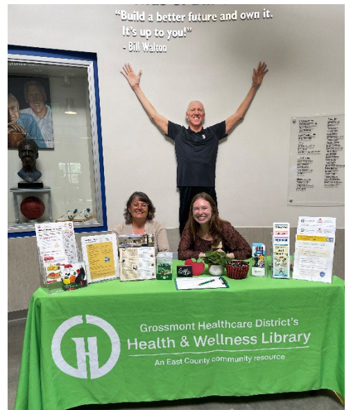
GHD tabled at the Boys & Girls Club Family Health Fair on May 2 nd