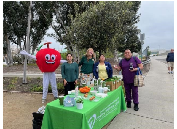
GHD celebrated National Hospital Day with free coffee & muffins for SGH staff