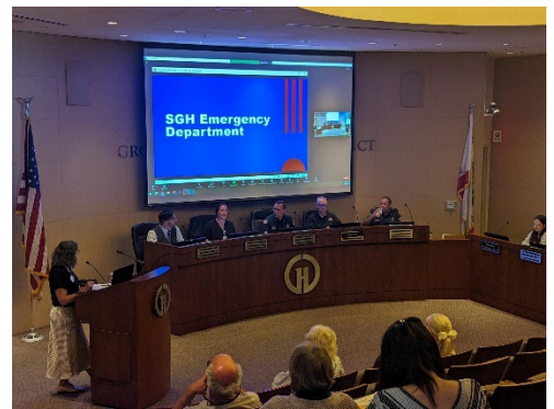
GHD hosted "Emergency Medical Services: What You Need to Know" on April 16 th