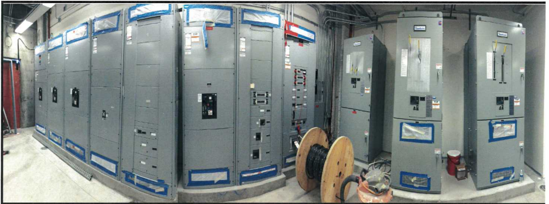
Level "B" Electrical Room w/ Automatic E-Power Transfer Switch