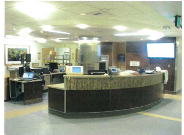
Central Nurses' Station