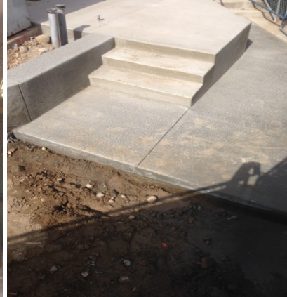
O2 Farm Phase 1