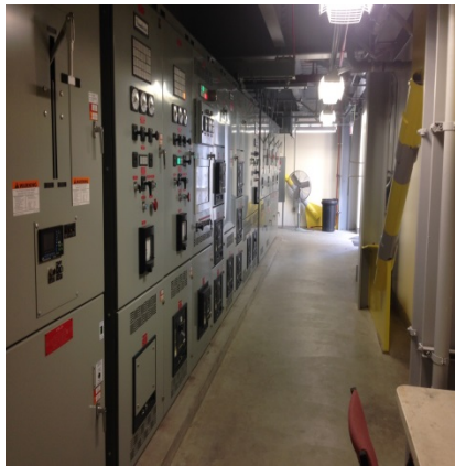
OSHPD Signed off Emergency Power Room