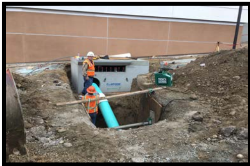
Storm Drain Inlet Install