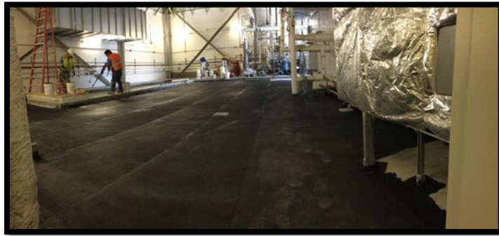
Penthouse Water Proofing