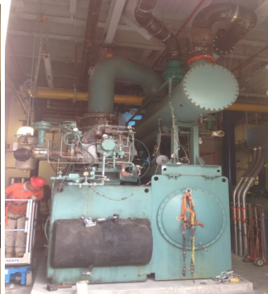
950Ton Steam Chilled in new CEP