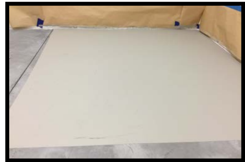
Level B Ardex Flooring Mock-up