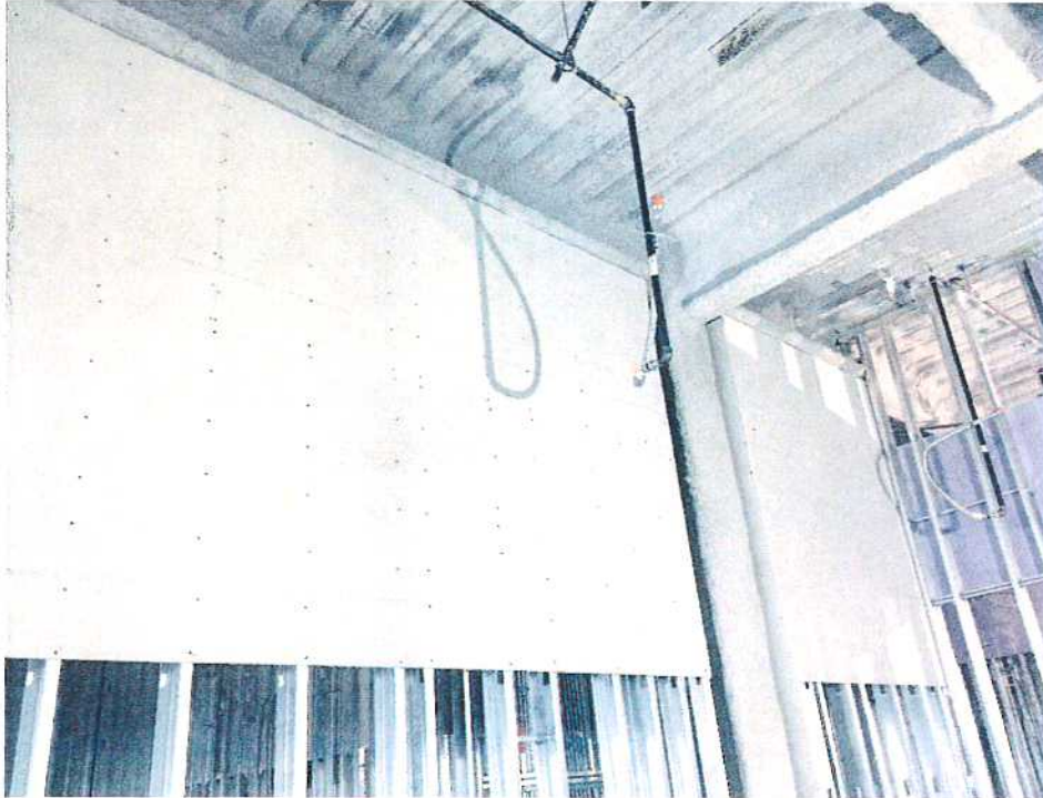
6-16-17: Sprinkler head drops installed; top-down drywall in place.