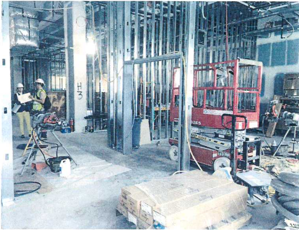
6-5-17: Framing at North corridor.