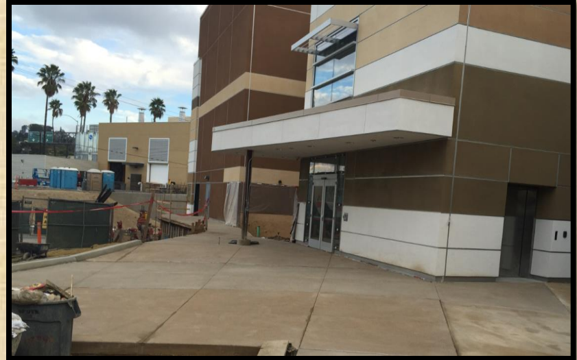
Level A North Hard Scape