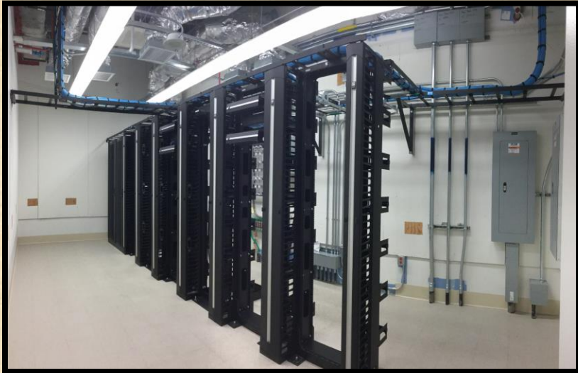
Level B Data Room