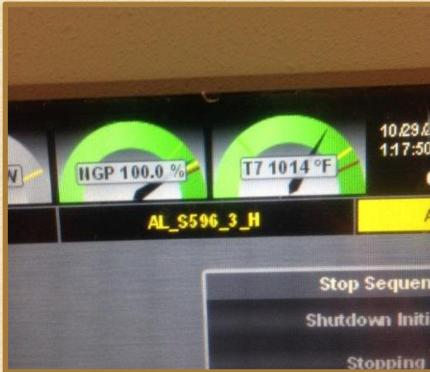
Turbine control shows it running at 100 %