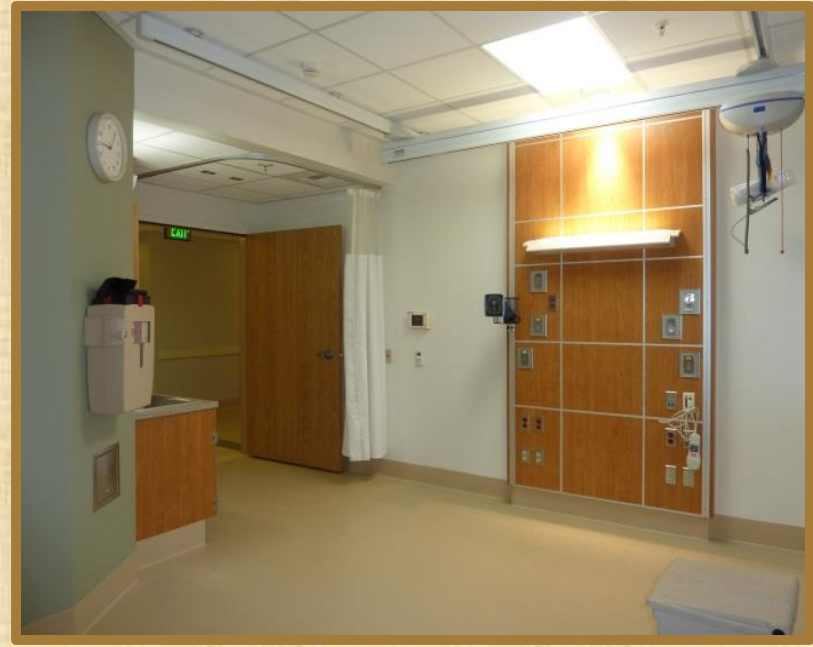
ADA Patient Room 529