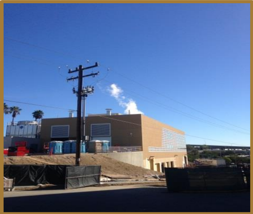
Steam production from Heat Recovery Steam Generator (HSRG)