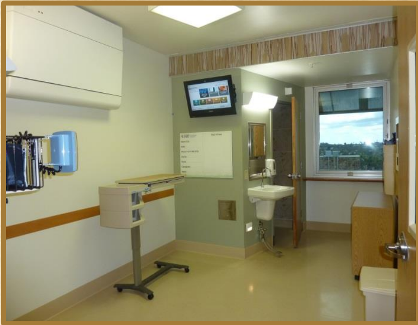
Neg. Pressure Patient Room 510