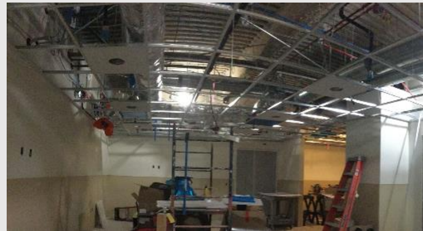
Employee Lounge Ceiling Grid Installation