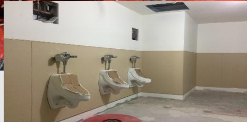
Plumbing installation – New Restroom