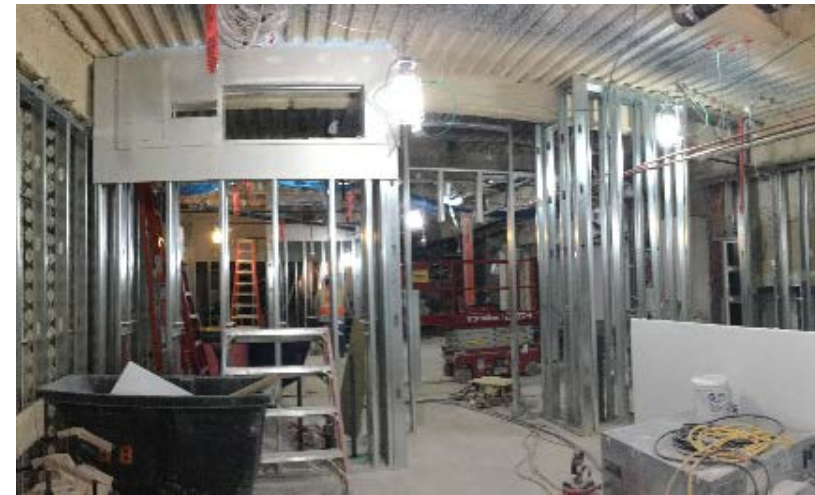
Install Wall Frame & Top-Down Drywall