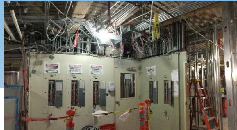
Ongoing Safe-off & Electrical Demo