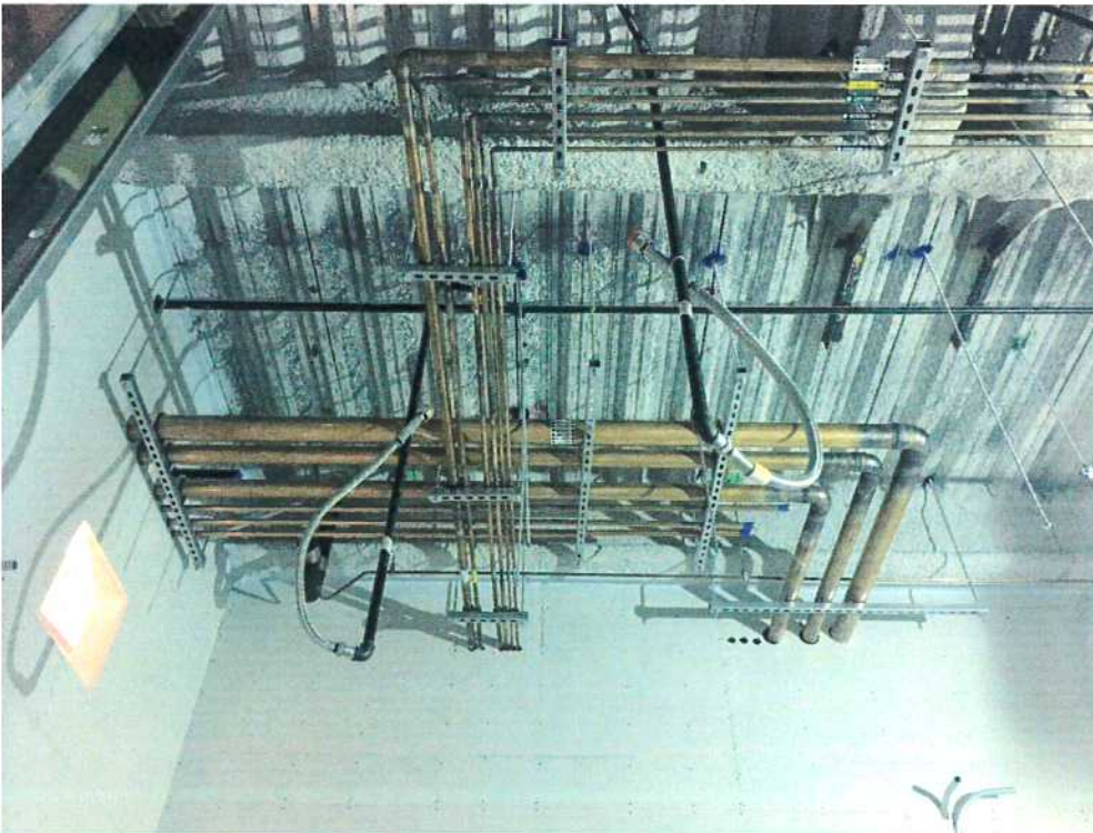
7-12-17: Medical Gas lines to OR's/booms.