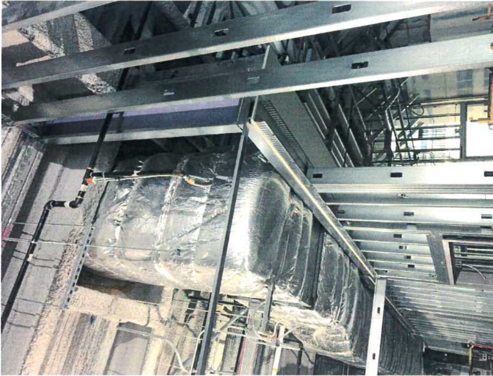
7-19-2017: Furring around mechanical ductwork conflicts in walls.