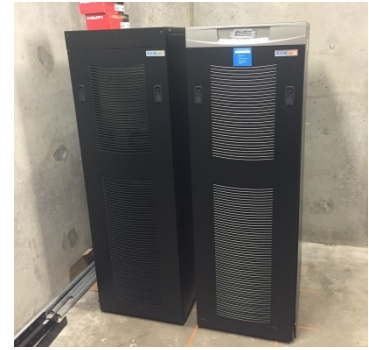
Lube Oil UPS