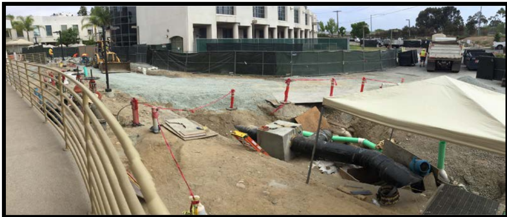
North UG Steam Line Tie-In and Backfill