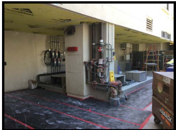
H&V North IAHU1 Ceiling Soffit Work