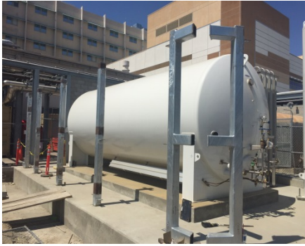
New O2 tanks, vaporizers, and SS for louver wall