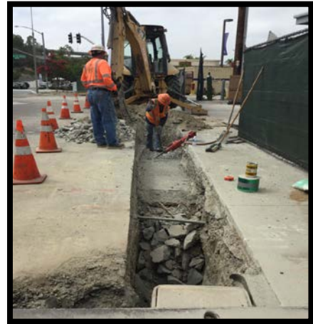
Helix Water Line Excavation