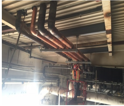
Medical gas and soft water lines being installed