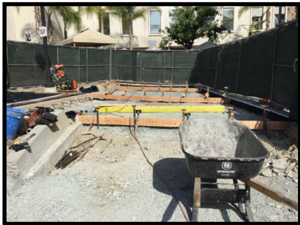
H&V North Hardscape Pour