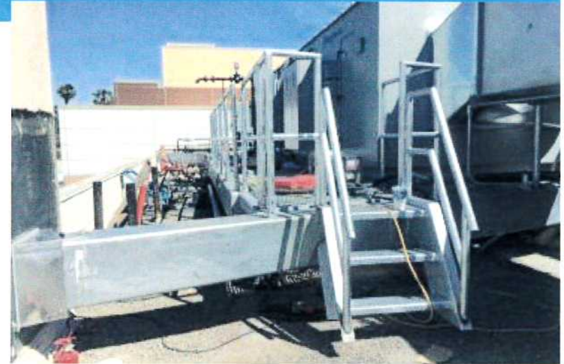
Air Handler Platform & Rail Installation