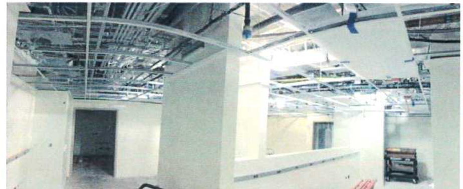
New Pathology Lab Ceiling and Lighting Installation