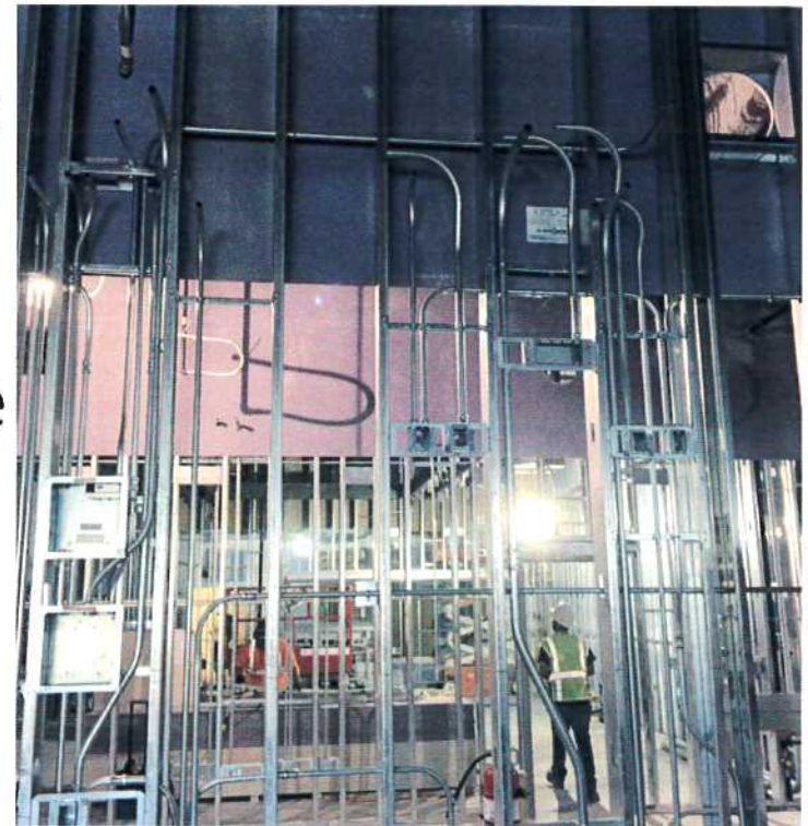
In wall rough-in of electrical conduits, outlets