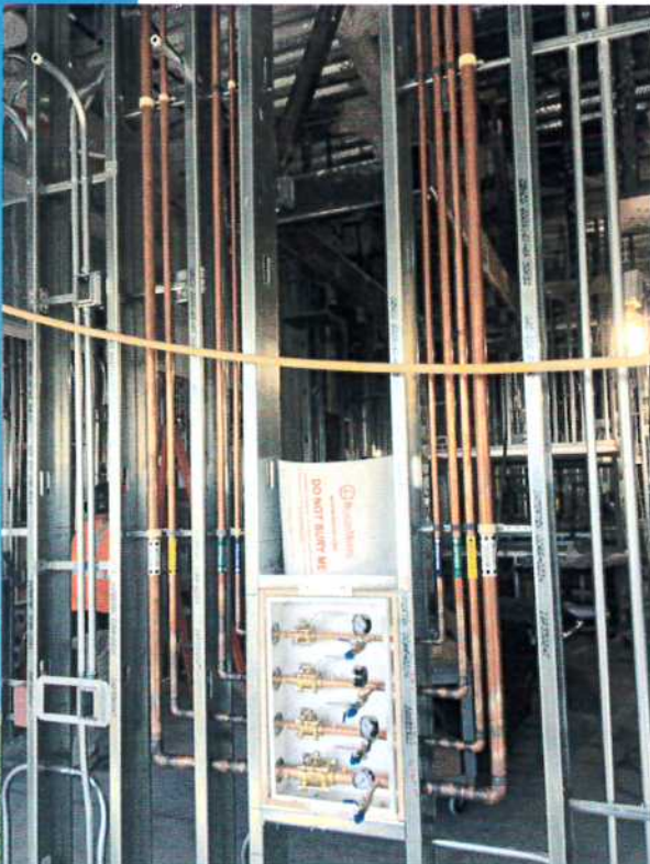
Medical Gas Zone Valve Box rough-in