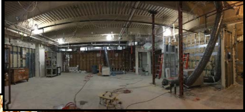
Demolition of former Surgery Prep-B Space