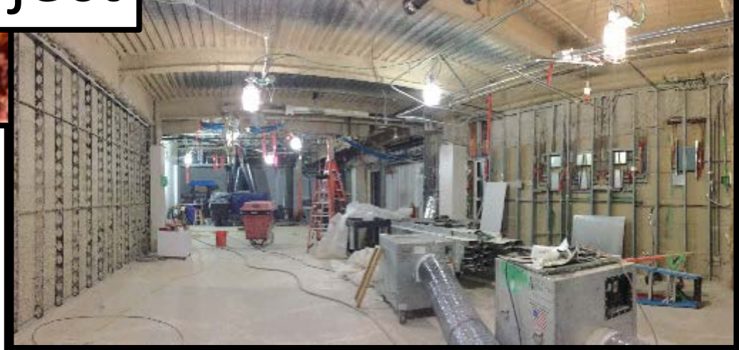
Demolition of former Surgery Prep-B Space