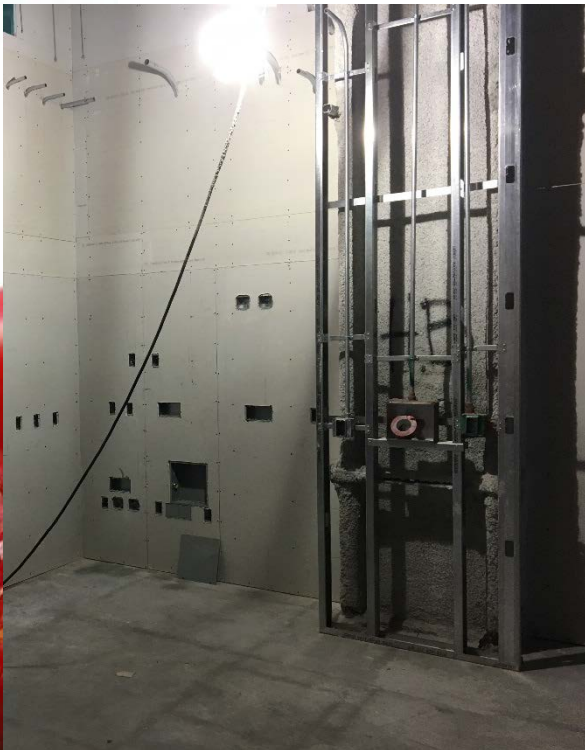
Drywall installed full-height in #1029 (Hybrid OR)