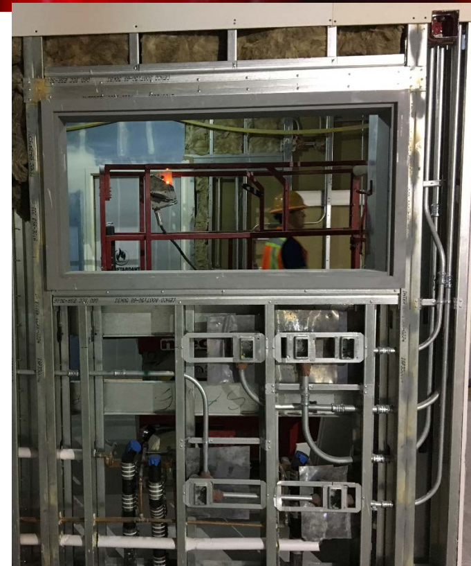
Replacement window frames above scrub sinks installed, Mechanical, Electrical, Plumbing rework underway