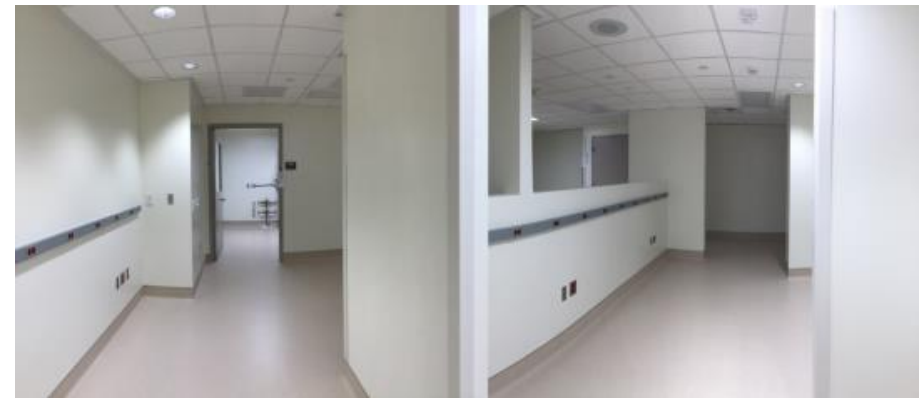
New Pathology Lab Ready for Occupancy