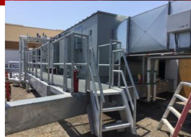
Air Handler Platform Installation