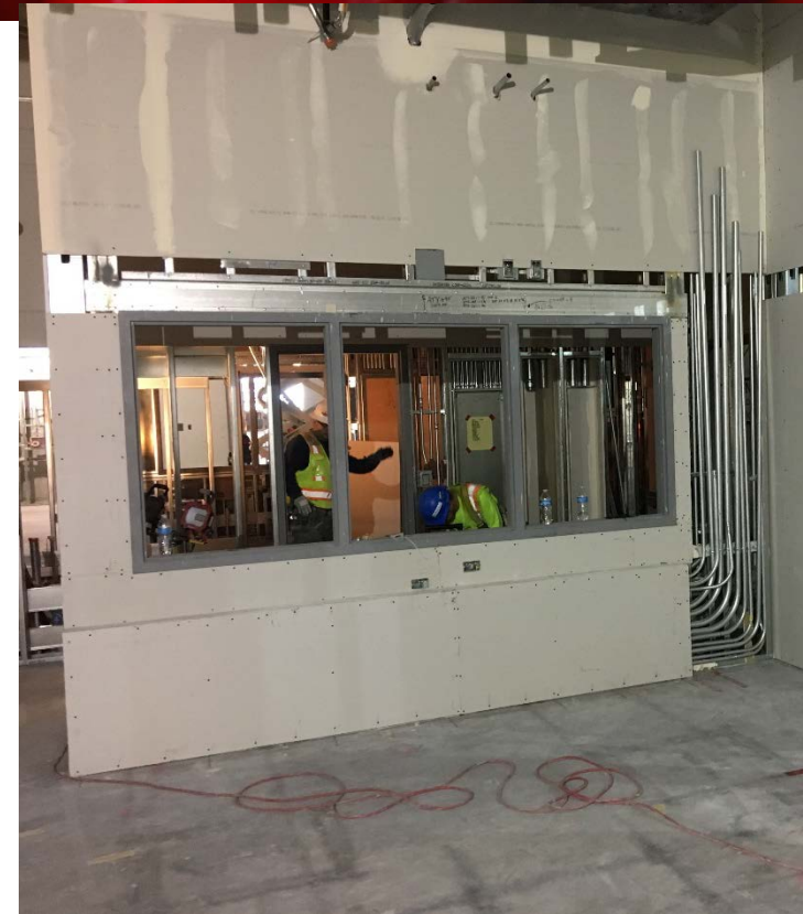
Typical control room: conduits & furring to accommodate all electrical & low voltage requirements