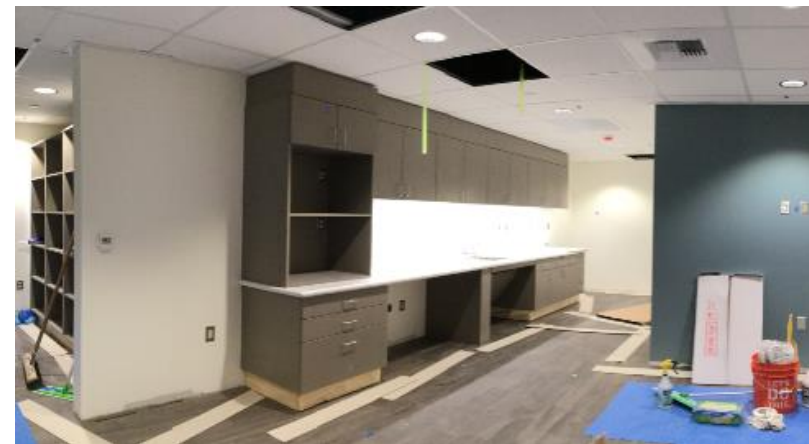
Casework Installation – Doctors' Lounge