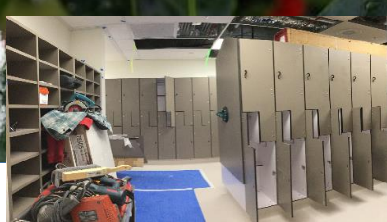
Locker installation – new locker area